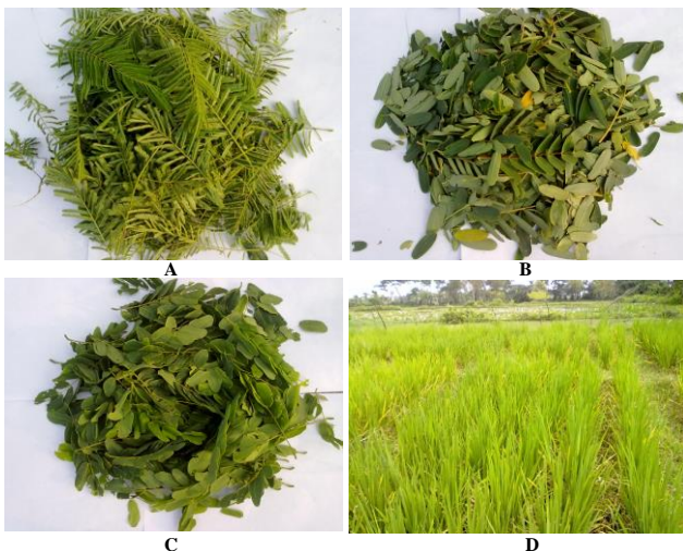
Fig. 1. Experimental view: (A) Green biomass of Ipil-ipil, (B) Green biomass of Bakphul (C) Green biomass of Minjiri, (D) Overall view of experiment.

The whole amount of various tree leaf biomasses such Ipil-ipil, Minjiri, Bakphul leaves were incorporated in experimental plots before final land preparation. Recommended dose of all fertilizers were Urea 180 kg ha -1 , TSP 90 kg ha -1 , Gypsum 60 kg ha -1 and MOP 40 kg ha -1 . Urea was top dressed in three equal splits i.e. 15, 30 and 55 days after planting (DAP). Thirty five (35) day old seedlings of cv. BR11 were collected from the Agronomy