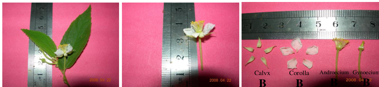
Fig. 1. Inflorescence and floral parts of China Cherry: A) leaf and inflorescence; B) complete flower; C) different flower parts.

length varied between 1.1 and 1.3 cm with mean magnitude of 1.14 \pm 0.083 cm and that of breadth varied between 0.75 and 0.90 cm with average of 0.86 \pm 0.086 cm. Petal area varied between 0.82 and 1.08 \text{ cm}^2 with being magnitude of 0.98 \pm 0.11 \text{ cm}^2 . Number of stamens per flower varied between 102 and 151 with mean of 121.2 \pm 1.95 and the stamen length varied between 0.4 and 0.6 cm with a mean of 0.48 \pm 0.09 cm (Table 2).